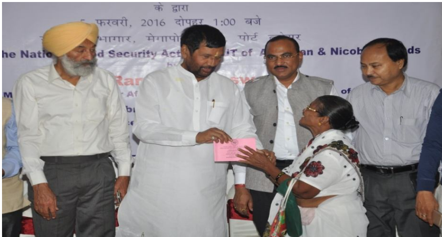
Formal Launch of NFSA by the Hon'ble Minister Shri Ram Vilas Paswan Ministry of Consumer Affairs, Food & Public Distribution, Govt. of India. New Delhi.