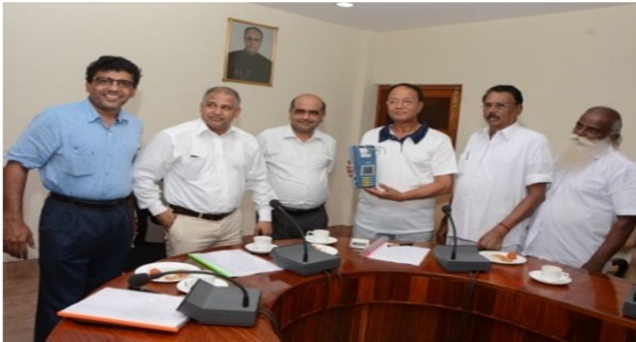
Formal Launch of FPS automation by the Chief Secretary, A & N Administration in the presence of Hon'ble Member of Parliament, A & N Islands, Port Blair.