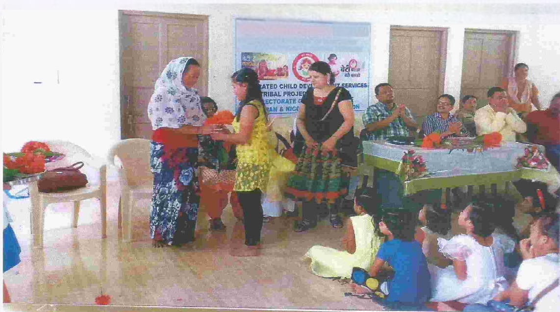
Awareness programme on Beti Bachao Beti Padhao