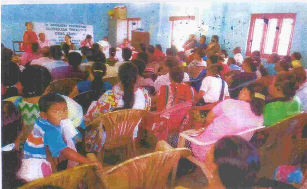
An awareness programme on ill effects of Alcoholism, Tobacco and Drug Abuse was organized at Pahalgaoon Panchayat Hall under ICDS Project Rangit