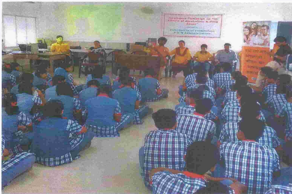
On 21st April, 2017, an awareness programme on the ill effects of Alcoholism and Substance (Drugs) Abuse in Kendriya Vidyalaya No. I