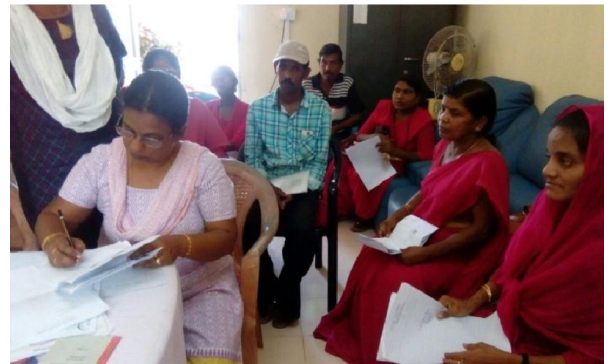
Life certificate verification and pension sanctioning camp