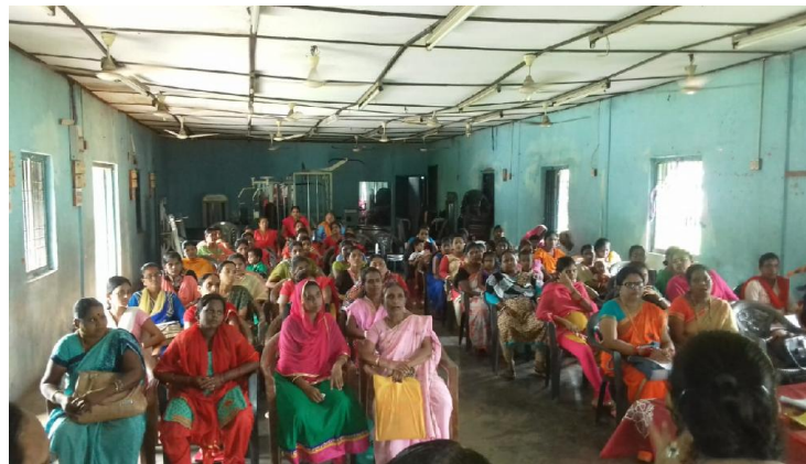
PMMVY camp at Port Blair and Diglipur