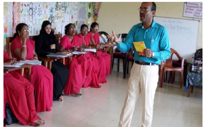
Training in Anganwadi training Centre