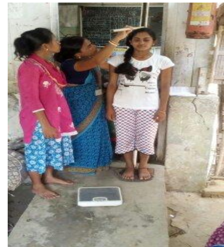
Different activities under Anganwadi Services